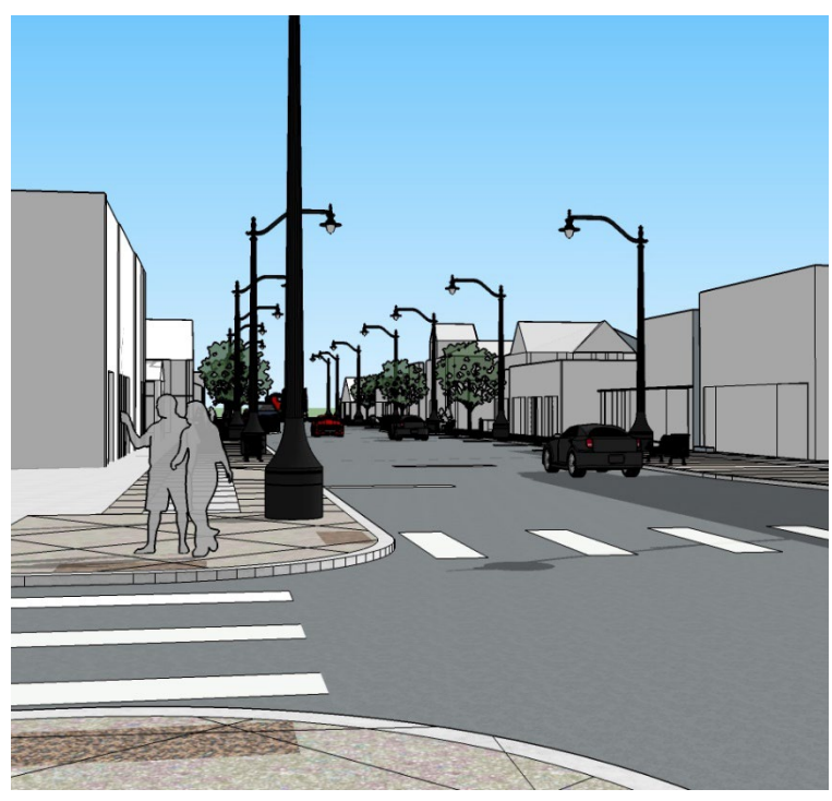
Pedestrian Looking South - Without Power Lines