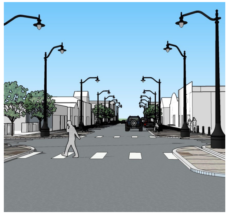
Driver looking North - Without Power Lines

Below are 3-D streetscape images of the Main Street Streetscape Project: