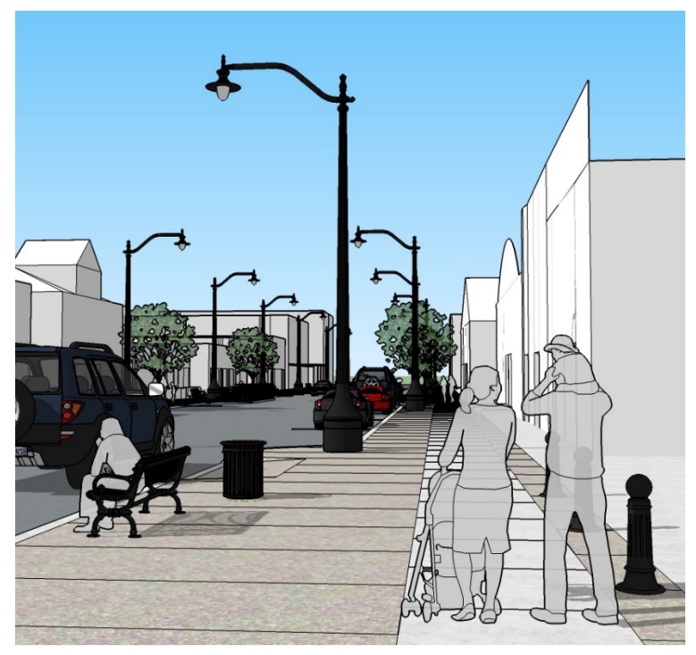
Pedestrian Looking North - Without Power Lines