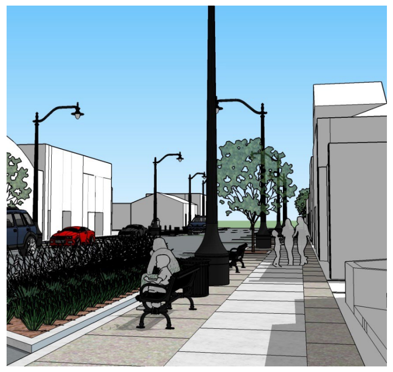
Pedestrian in the Middle Looking South - Without Power Lines